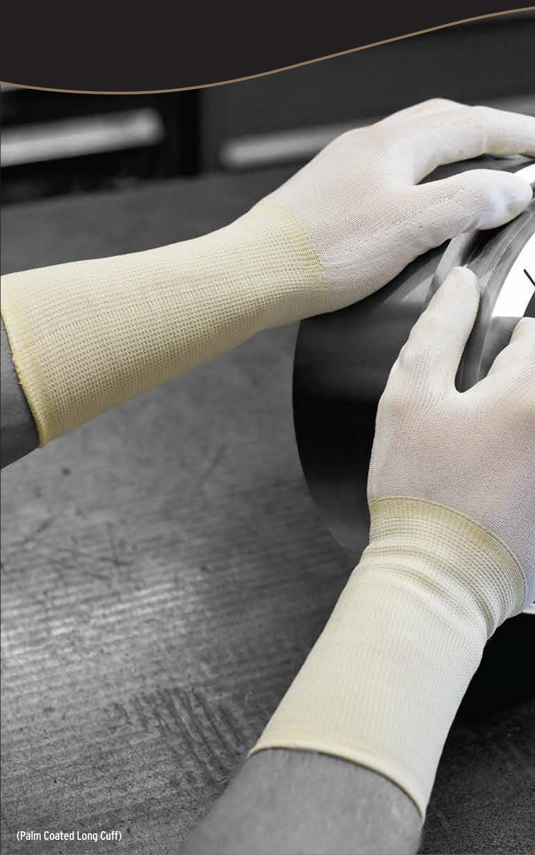
(Palm Coated Long Cuff)