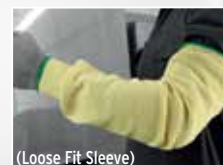
(Loose Fit Sleeve)